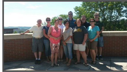
Pictured above is a view of the water from downtown Castine, ME as well as members of the Executive Board who attended this year's Summer Leadership Retreat